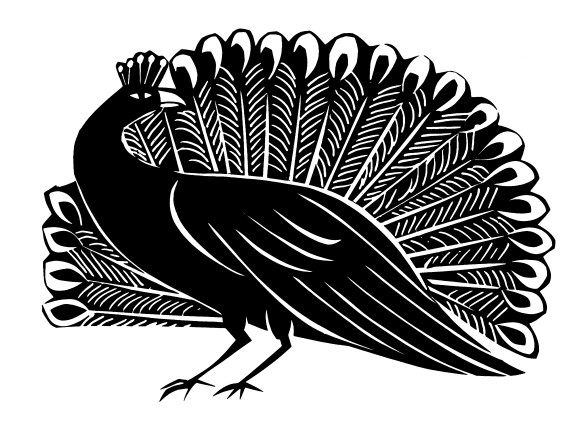
Christian symbolism: The peacock has been used in Christian art to symbolize the resurrection. A peacock's tail feathers will molt...turning ugly and "dead." But then fresh feathers emerge...and they are glorious. Thus, the peacock reminds you that in eternity...your ugly and "dead" bodies will rise to new glory.

In the peace of forgiveness, let us praise the Lord.